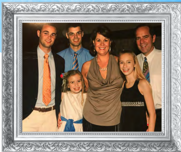
The Hemmer Family