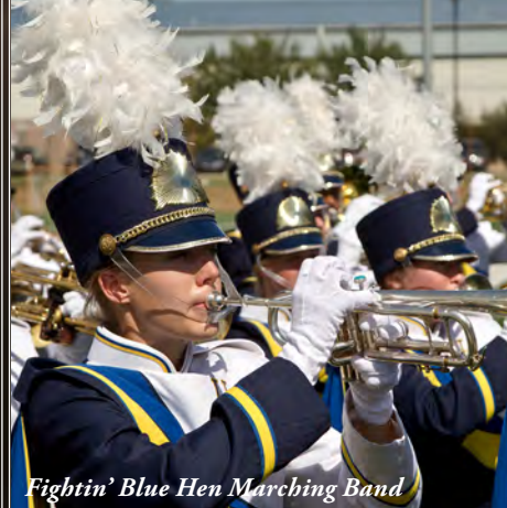
Fightin' Blue Hen Marching Band