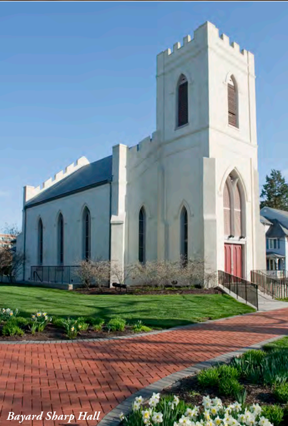
Bayard Sharp Hall