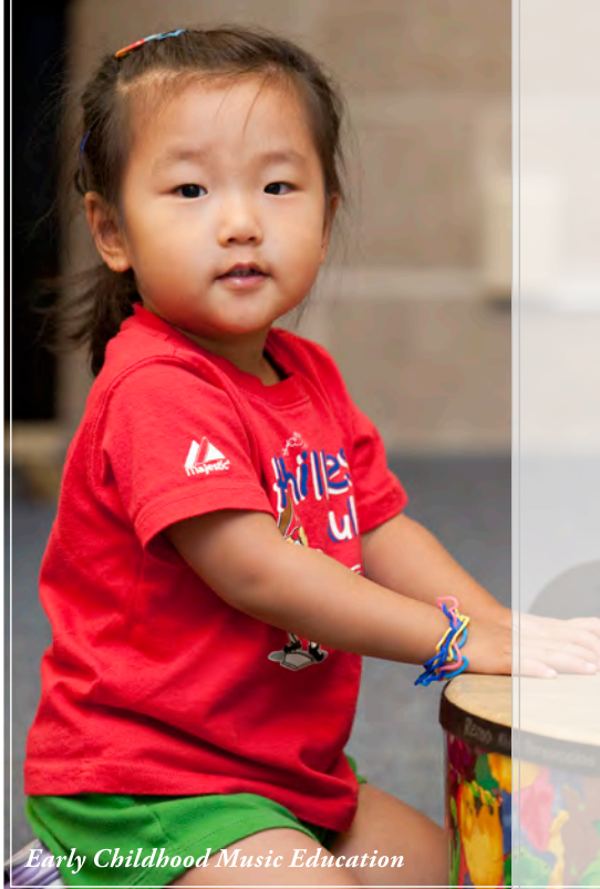
Early Childhood Music Education

Our award-winning ensembles travel the world, providing students with unique performing and teaching opportunities. In recent years, the Department of Music has sent students to England, Greece, Estonia, Hungary, Spain, Colombia, Israel, Taiwan, Austria and Germany to compete internationally, present at conferences, and be featured at international symposiums for performance, scholarship and research.