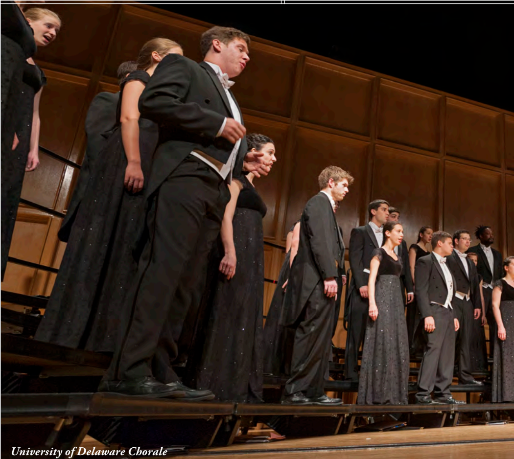
University of Delaware Chorale