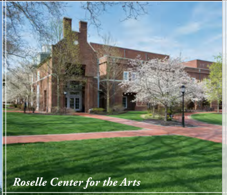
Roselle Center for the Arts