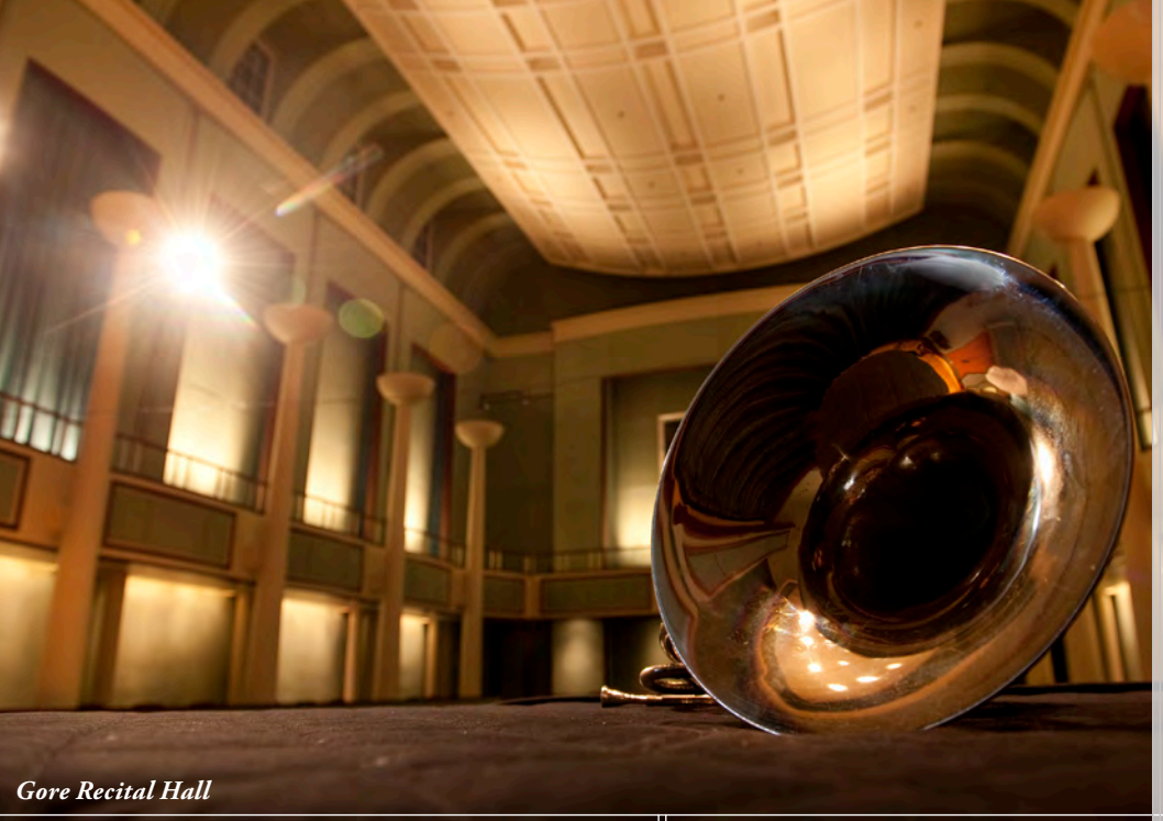
Gore Recital Hall