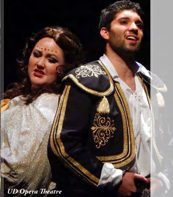
UD Opera Theatre